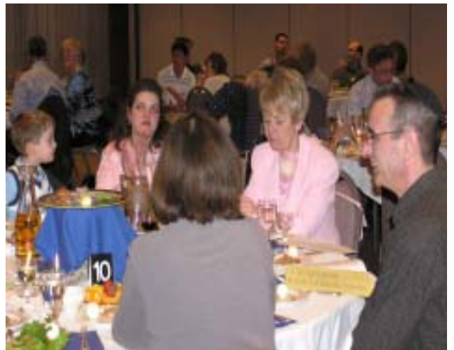
Families unite at the Seder table

Special Thanks for making Temple Israel's Second Night Seder Special