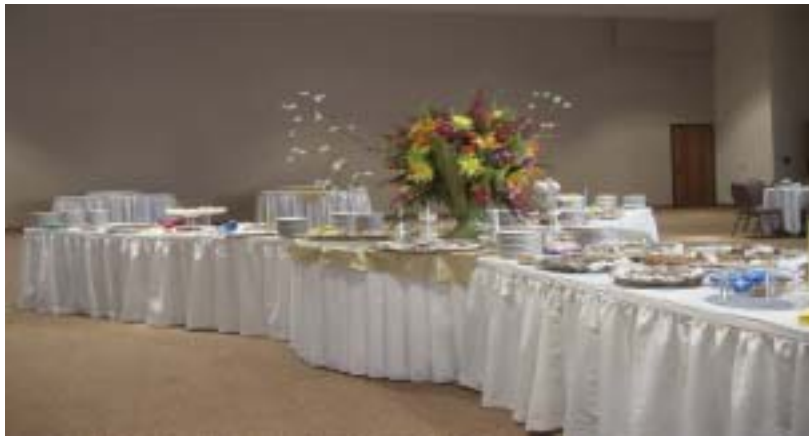
Gala Oneg Shabbat - Friday, April 9 -We do it right!