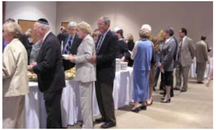
Congregants gather at the Kiddish Lunch Buffet on Saturday, April 10