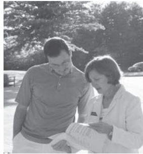
Checking families in