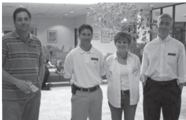
Greeters - "May we help you?"