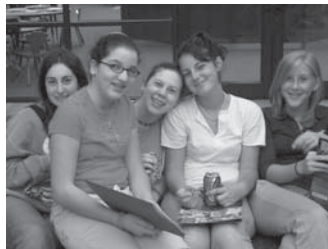
Girls catching up