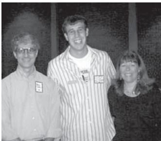
A great staff !