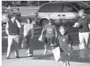
Come on in !!