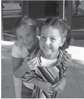
Little ones - tickled to be here !