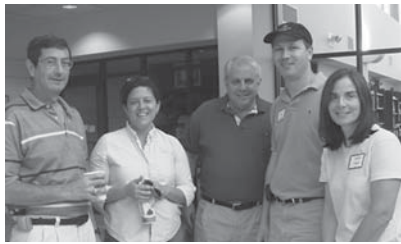
Greeters-waiting to help