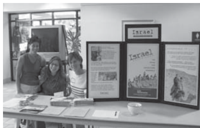
Have an Israel experience!